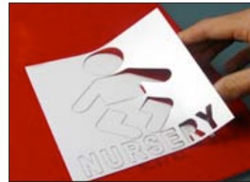
3. Weed away tactile material to reveal pictogram and text, ready for installation.