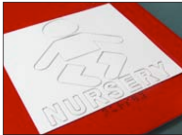
2. Apply and engrave tactile material.