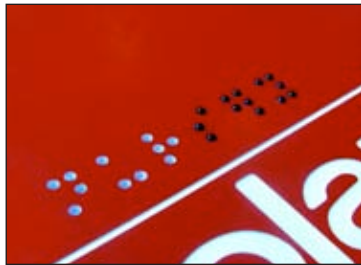
1. Engrave raster braille and insert rasters.

Watch the how-to video at www.rolanddga.com/ada