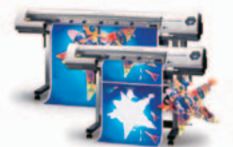
VersaCAMP® SP-i Series SP-300i $13,495 US SP-540i $17,895 US