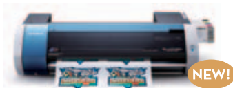
VersaStudio BN BN-20 $8,495 US