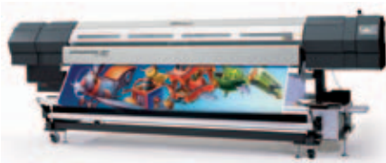
AdvancedJET AJ-i AJ-1000i $62,995 US

No matter what you spend on a printer, or how much effort you put into getting the print right, in the end there's only one thing that actually hits the media - your ink. Roland inks are designed to work in concert with Roland inkjet devices, RIP software, and certified media to deliver consistently outstanding results, day after day. The result is better prints. Wider color gamuts. Lasting durability. Happier customers. And more profits. To view our full lineup of award-winning inks, visit www.rolanddga.com/inks .