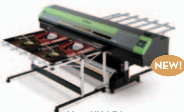
VersaUV LEJ LEJ-640 $67,995 US