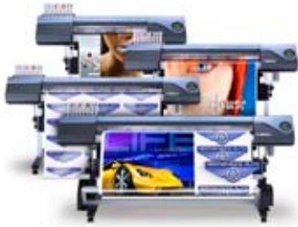
VersaCAMM® VS Series VS-300 $17,495 US · VS-420 $18,995 US VS-540 $22,995 US · VS-640 $26,495 US