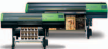
VersaUV LEC LEC-330 $57,995 US LEC-540 $67,995 US