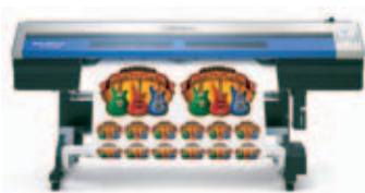
SOLJET™ PRO III XC-540 $31,495 US