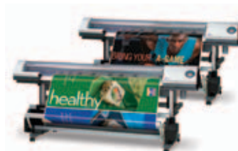
VersaArt RS Series RS-540 $16,295 US · RS-640 $17,895 US

ECO-SOL MAX mild solvent ink boosts the performance of SOLJET and VersaCAMP inkjets with improved scratch resistance, faster drying time, higher density, wider color gamut, broader uncoated media support, and lower cost per square foot. MAX is virtually odorless and durable up to three years outdoors without lamination. CMYK+LcLm and CCMYK inksets are available.