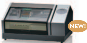
VersaUV LEF LEF-12 $29,995 US