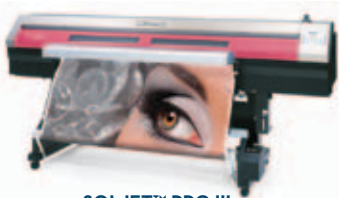
SOLJET™ PRO III XC-540MT $39,995 US