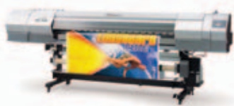
Hi-Fi Express FP FP-740 $41,995 US