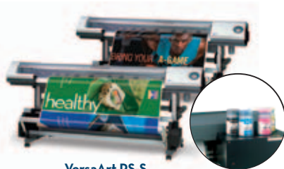
VersaArt RS-S RS-540 $16,295 US · RS-640 $17,895 US Bulk Ink Unit for Sublimation Option $1,995 US